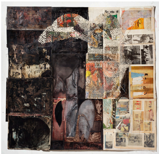
Ellen Gallagher, Hare , 2013. Ink, watercolor, oil, pencil and cut paper on paper. 44 4/5 × 46 3/5 in. Private Collection. Courtesy Hauser & Wirth. Photo credit: Ernst Moritz