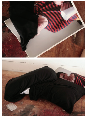
Paul Sepuya, Lav, displaced from "Glasgo Turnpike" series, 2010